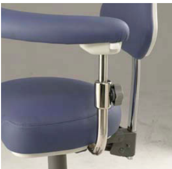
Ratcheting abdominal support with adjustable height

Right-handed bodyrest pictured Specify Left-handed for opposite bodyrest mounting